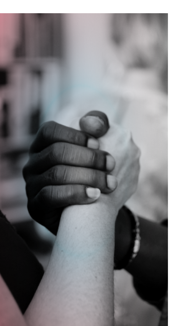
Supporting each other

In accordance with our fundraising strategy, ISHR acquires and prudentially manages the financial resources necessary to flexibly and effectively implement this Strategic Framework, ensure the security, sustainability, agility and effectiveness of the organisation, and establish and maintain a core minimum reserve.