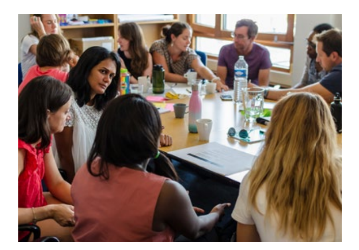
Strategy planning at ISHR