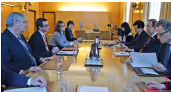
In March 2014, ISHR, Human Rights Watch, Amnesty International and the International Commission of Jurists met with the UN Secretary-General to discuss the protection of human rights defenders, the prevention of reprisals, and accountability for gross violations in Syria and North Korea.