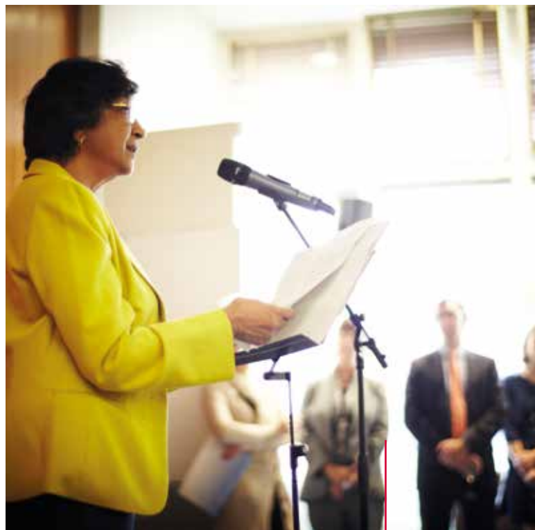
UN High Commissioner for Human Rights, Navanethem Pillay was bid farewell at a civil society reception in July 2014, organised by ISHR with the support of Amnesty International, Human Rights Watch, Conectas, East and Horn of Africa Human Rights Defenders Project, FORUM-ASIA, FIDH, and the Cairo Institute for Human Rights Studies.