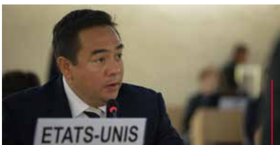
Throughout 2014, the US played a vital role assisting to secure UN consultative status for NGOs in New York and speaking up to defeat efforts to silence NGOs through repeated 'points of order' at the Human Rights Council in Geneva.